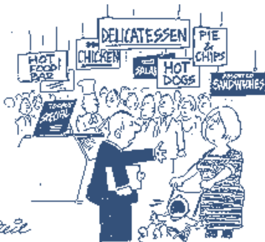
"Feed a baby in here? Out of the question!"